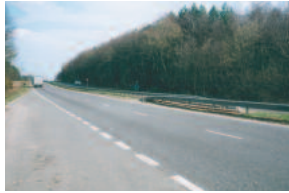
After safety fencing installed.