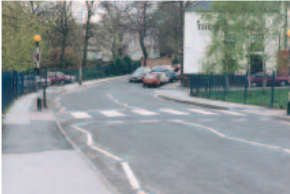
Raised zebra crossing.