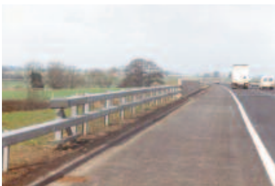
Hollow box section and concrete barrier bridge parapet.

Wire rope safety fences (TD 32/93) are normally a four rope system with two upper and two lower steel ropes intertwined around steel posts. The full height posts at the end of each anchorage must be firmly concreted into the ground. They should not be used on bends due to the posts being designed to shear at their base. On straight sections they are much less expensive to install with maintenance costs found to be only ¼ of that of steel beam section barriers. However, motorcycle groups have also widely criticised wire rope safety fences chiefly because the posts are more exposed and it is believed that their tops will act as a saw tooth edge increasing the risk of lacerations.