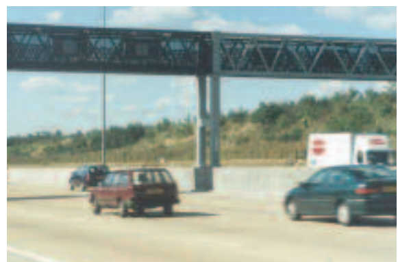
Concrete motorway divider.